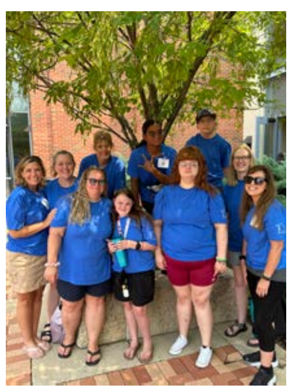
The Wisconsin participants at MTI.

In addition, on Saturday evening, two buses arrived to transport the entire crowd to the St. Louis "MUNY," America's oldest and largest outdoor musical theater. The Muny provided two interpreters with a seating section near the stage for those who needed ASL access. The Muny also offered the group two different types of headsets. One was an amplification device to enhance the voices on stage. The other headset offered a descriptive version of what was happening on stage. It described the background, the costumes and the movements of the actors. Theatergoers encouraged each other to try either or both of the headsets. This opportunity was helpful to both the students and their families. Many had not had the opportunity to experience these