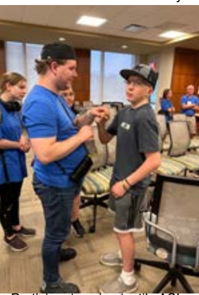
Participants using tactile ASL.

I wouldn't feel so scared. MTI was a very good experience. I was able to learn more about what I need to do to get ready to go to college and get a job. It was a really great opportunity for me. It was the first time I stayed on a college campus and slept in college dorms. I learned a lot about college. I also learned that I need to continue to improve my writing and reading. I am really glad I went to MTI."